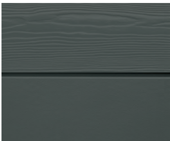
C60 Forest Grey**