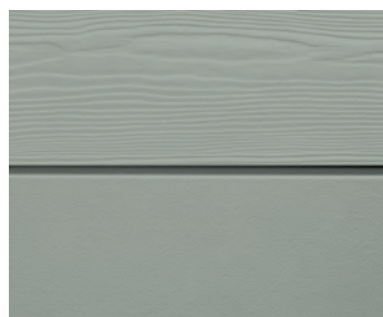
C06 Grey Green **