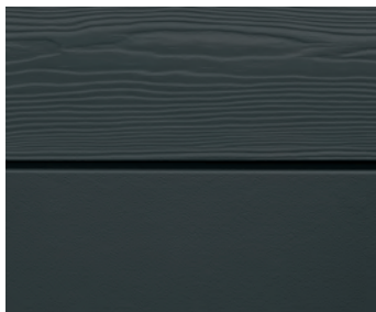
C04 Dark Brown**†

C Cedral Click and Cedral Click Smooth standard factory-applied colour range.