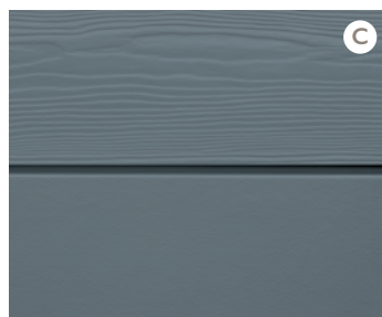
C15 Dark Grey