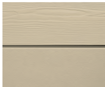
C08 Sand Yellow**