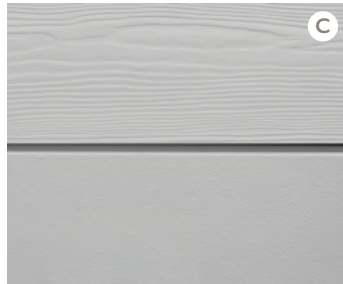
C51 Silver Grey