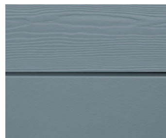
C62 Violet Blue **