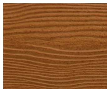
CL104 Light Oak *