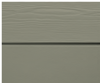
C57 Sage Green**