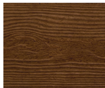
CL105 Dark Oak *