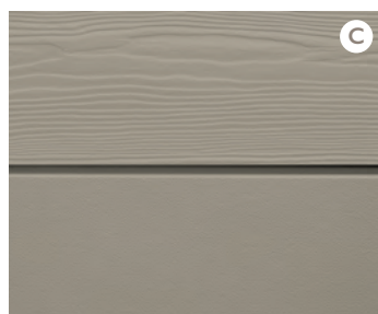
C03 Grey Brown †