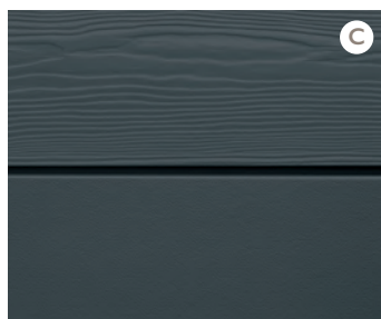
C18 Slate Grey †