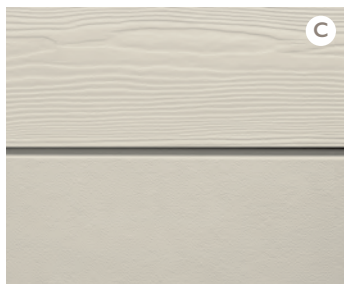
C07 Cream White†