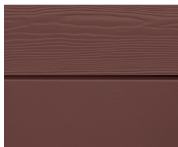
C61 Burnt Red **