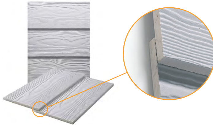
Cedral timber effect

Cedral Lap planks are fitted in a traditional lapped style.