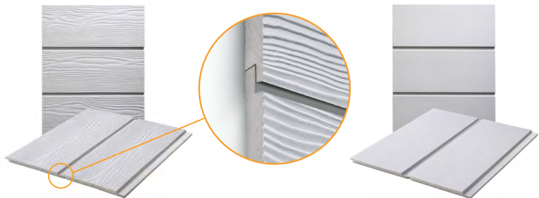
Cedral timber effect

Cedral Click planks are fitted together flush, creating a modern and contemporary facade. Available in two finishes.