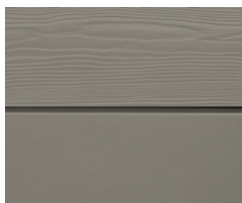
C14 Atlas Brown **†